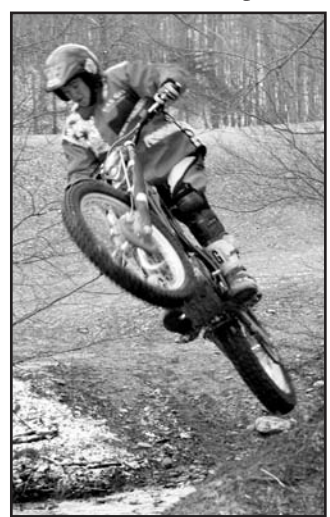
Annual Trackrock Trials

At 9:30 a.m. on Saturday, there will be a Youth Trials Division competition